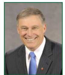
SPECIAL REMARKS: Governor Jay Inslee